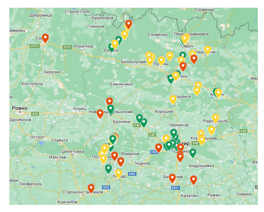
Fig. 7. Location of the sampling sites in 1998–2013 and 2019–2020 periods (red marks indicate sites of 1998–2013 where sampling was not repeated in 2019–2020; green marks indicate sites of 1998–2013 re-surveyed in 2019–2020; yellow marks indicate sites first surveyed in 2019–2020)